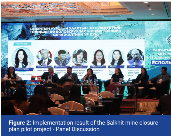
Figure 2: Implementation result of the Salkhit mine closure plan pilot project - Panel Discussion

Two informative sessions facilitated discussions and knowledge sharing. The first centered on the lessons learned from the MCP pilot project, while the second focused on ensuring the long-term sustainability of the MCP. Representatives from Chuluut bagh, a local community, voiced their concerns about the social and economic aspects of mine closure and post-closure monitoring.