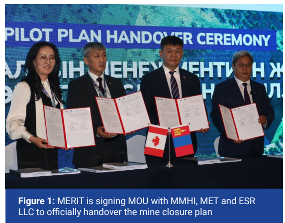
Figure 1: MERIT is signing MOU with MMHI, MET and ESR LLC to officially handover the mine closure plan

The primary purpose of the conference was to formally transfer the completed mine closure plan from MERIT to ESR, marking the end of MERIT's role in the project and designating ESR as the entity responsible for submitting the plan to the government for approval. Additionally, this conference provided a platform to present key recommendations to government officials and industry stakeholders, outlining best practices and strategies for the widespread implementation of effective mine closure planning throughout the mining sector.