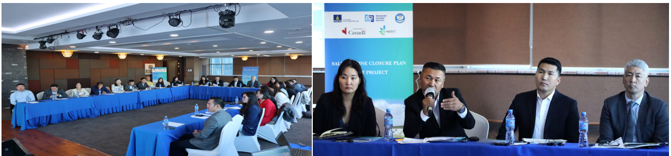
Figure 1. Key stakeholder meeting was organized in UB on 26 August 2022

The key stakeholders gathered on August 26th to receive an update on the team's work over the summer months. Topics included the stakeholder engagement strategy, presented by the MERIT stakeholder advisor, and the environmental field studies which were conducted in late June, presented by MECSZB (environmental consultant).