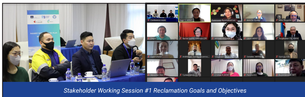
Stakeholder Working Session #1 Reclamation Goals and Objectives

In conclusion, upcoming stakeholder engagement sessions will finalize closure goals for the mine and start to develop objectives. The February issue of the newsletter will provide updates on this process.