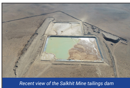
Recent view of the Salkhit Mine tailings dam