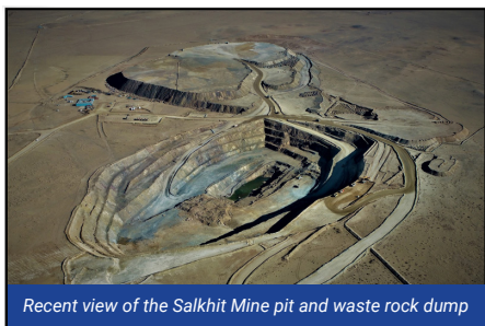
Recent view of the Salkhit Mine pit and waste rock dump

deposit in June 2019. In January 2020, the Government of Mongolia decided to use resource wealth from the Salkhit project to repay a portion of the pension loan of 230 000 senior citizens. After this repayment, ESR began financing its own operations through silver ore sales. Further geological exploration work, and facility retrofits and improvements have occurred since then, and silver ore has been sold to China and Europe. ESR continues with feasibility studies in an ongoing effort to optimize production. The images below illustrate the active mine pit, waste rock dumps, tailings dam, and ore processing facility