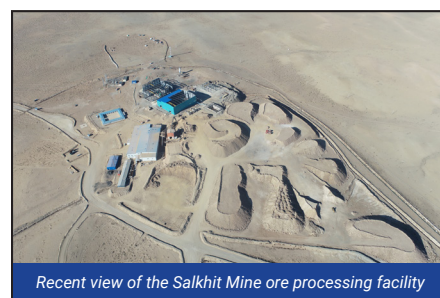
Recent view of the Salkhit Mine ore processing facility